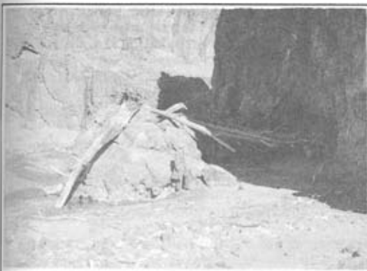
Fig. 2--Log jam caused by flood of June 1914 in Sibley Mt. box of Trujillo Arroyo, N. M.