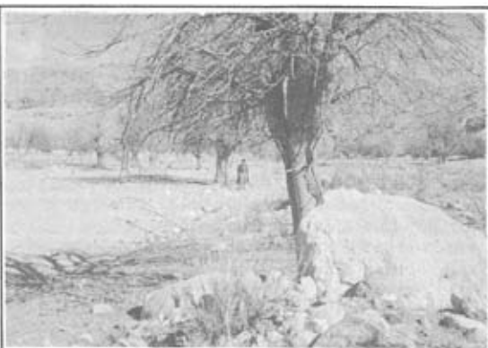
Fig. 3--Water abrasion on walnut tree in wide channel of Trujillo Arroyo, N. M.